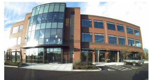
Typical wide angle lens